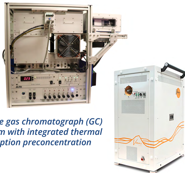
Online gas chromatograph (GC) system with integrated thermal desorption preconcentration

A compact, field-deployable GC-PTR-TOFMS for the in situ monitoring of volatile organic compounds (VOCs)